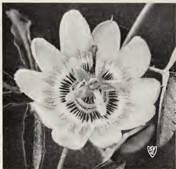
PASSIFLORA COERULEA, OR PASSION VINE

CLEMATIS MONTANA RUBENS —Unlike the preceding, this is spring flowering with small light pink blossoms appearing just before the leaves. Very hardy, robust vine for all sections of the country. 50c each.